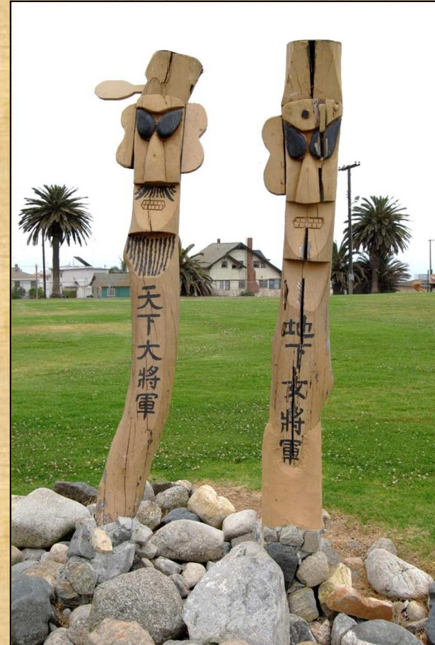
Jangseung at Korean Bell of Friendship, San Pedro, California.