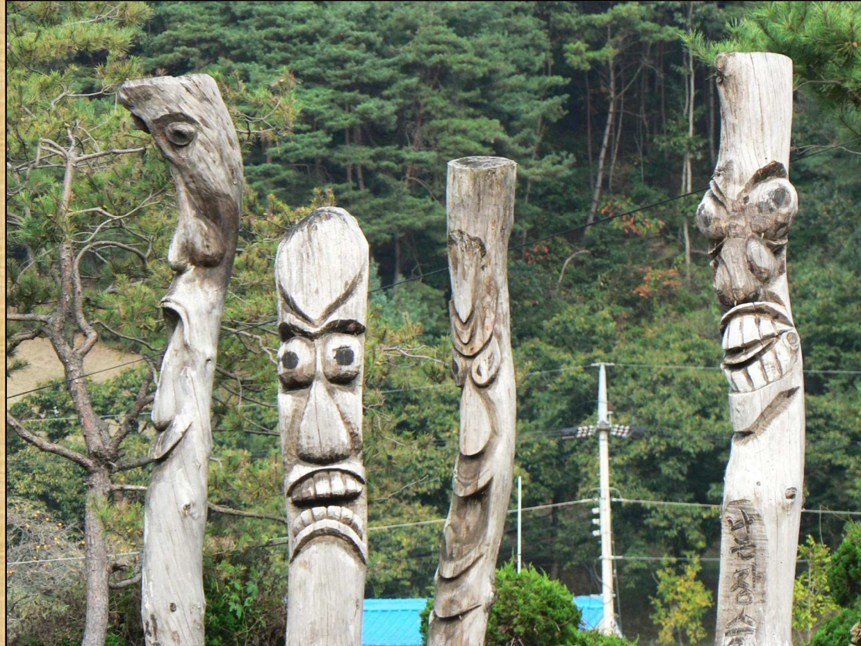
Jangseung in Seoul, Korea.