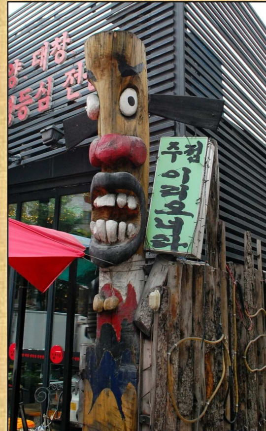
Jangseung in Sinch'on, Seoul.