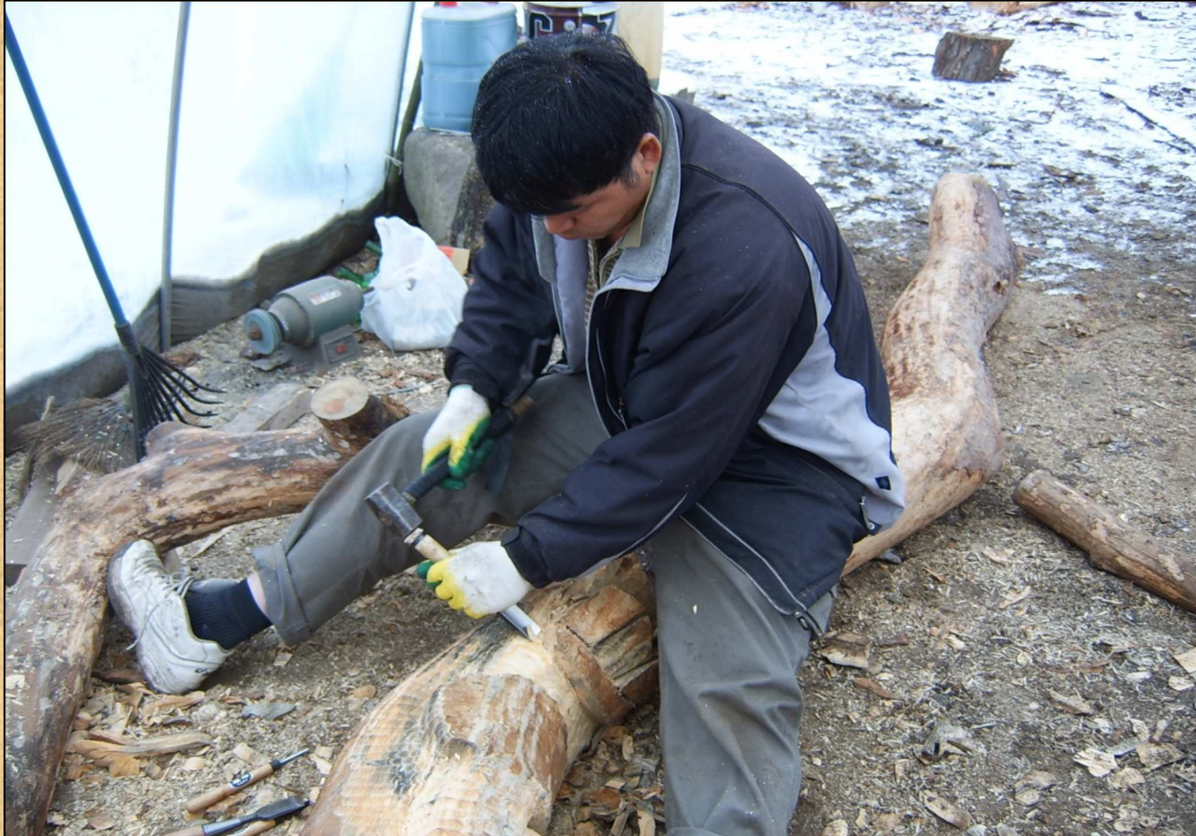
Photo of Carving Jangseung from Hyeondo Jangseung Village, ©2006 by Jangseung Village (used by permission).