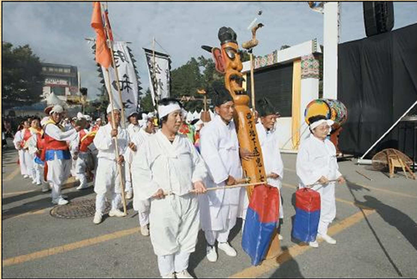
"Tancheon Jangseung Ceremony of Gongju"