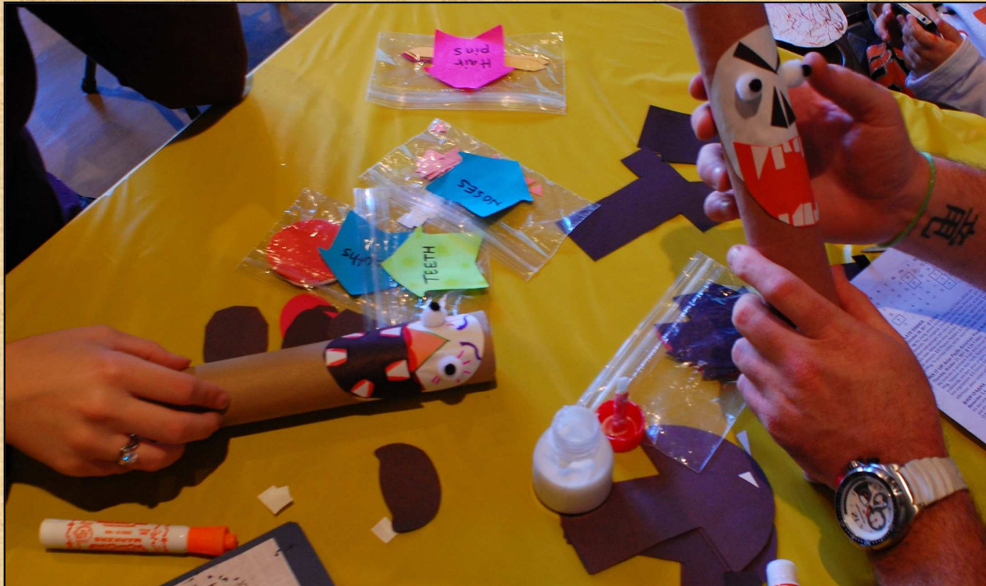
Jangseung Workshop at Wing Luke Museum.