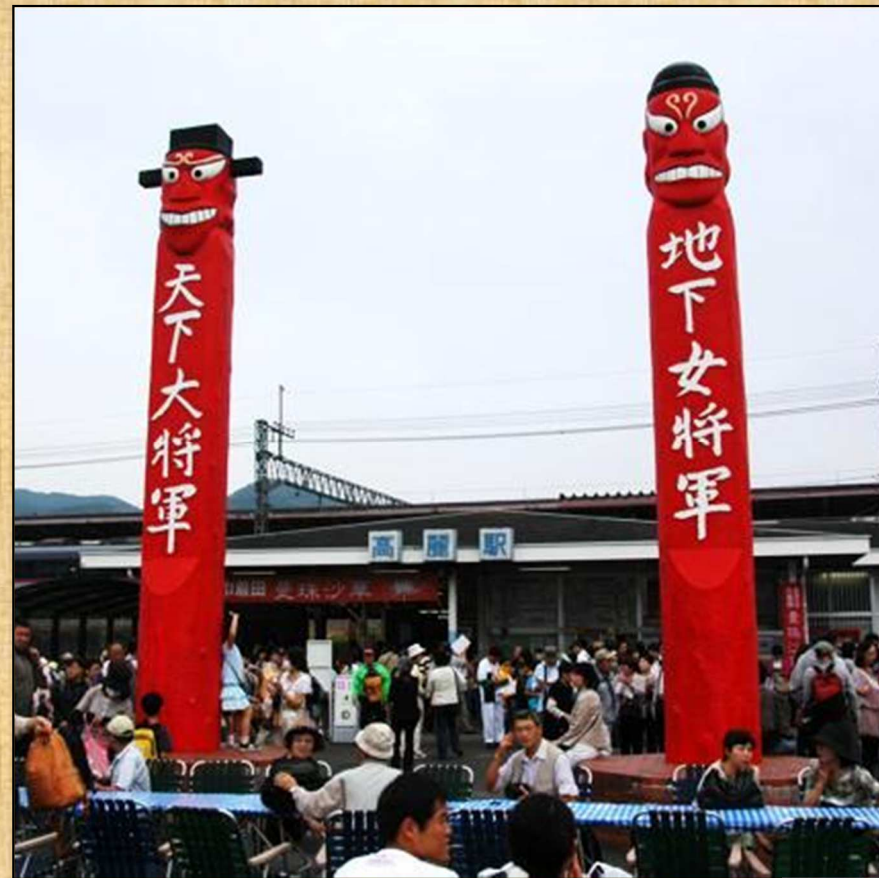
Jangseung at Koma Station, Saitama, Japan.