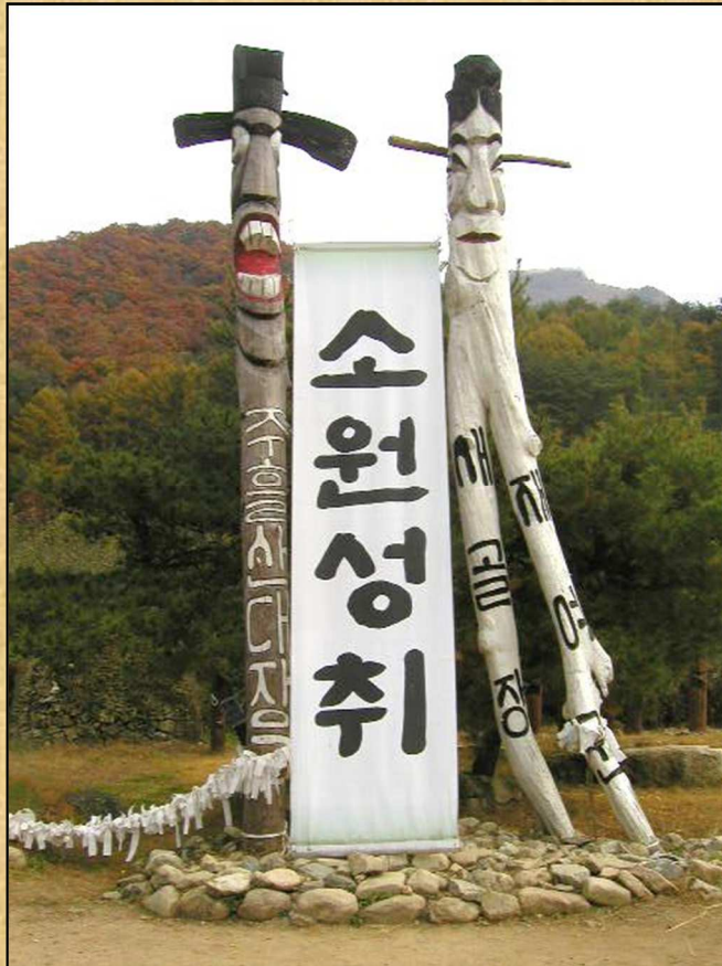
Jangseung in Mungyeong Saejae Provincial Park, Korea.