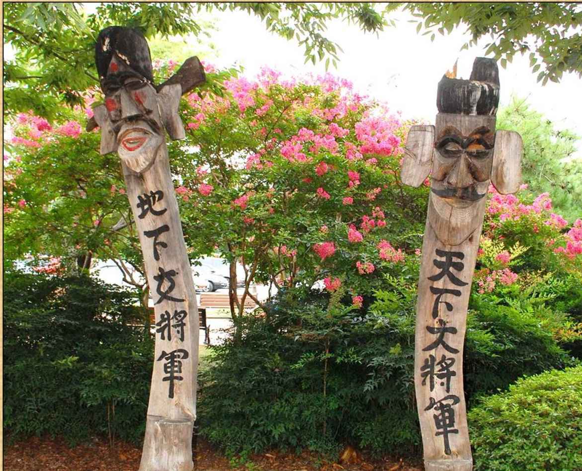
Jangseung in Duryu Park, Taegu.