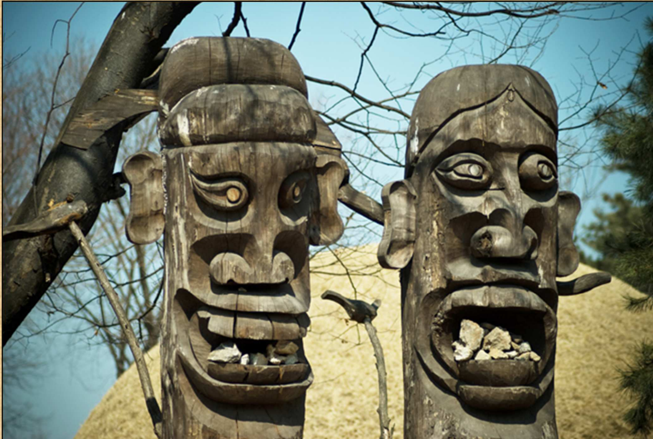
Jangseung, in Seoul.