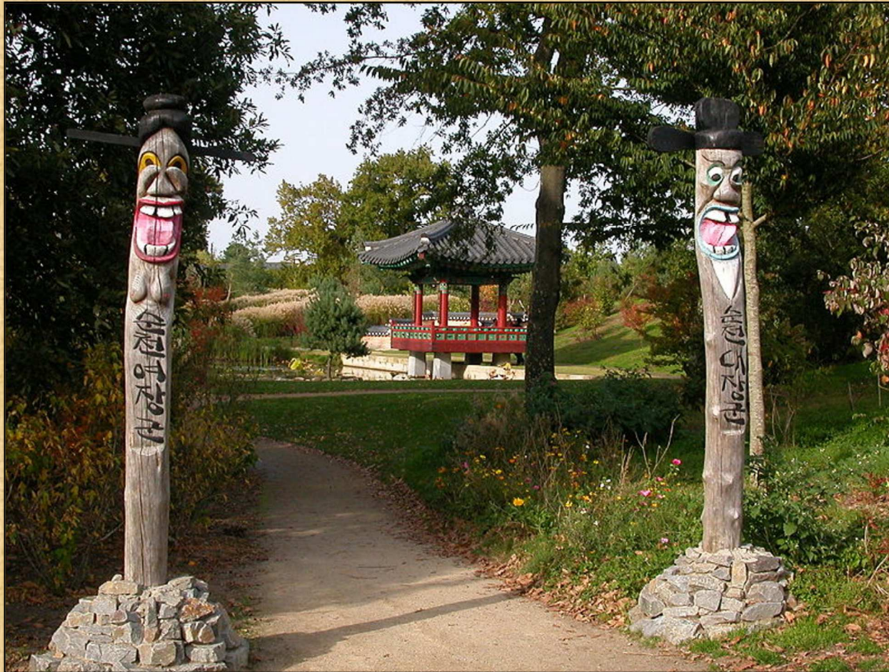
Jangseung in Grand-Blottereau Park, Nantes, France.